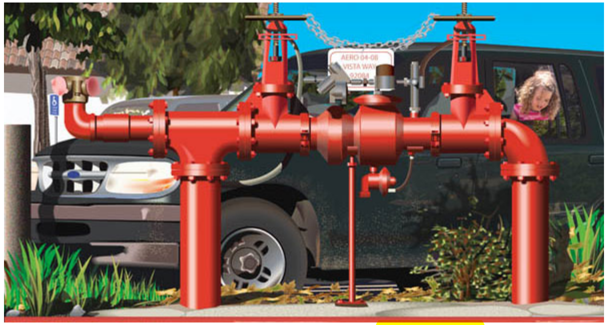
Working with pattern brushes and some incredible details, Aaron McGarry takes full advantage of Illustrator's symbol libraries and brushes to generate the greenery and foliage around the pipes! Components of the piping were taken from the symbol libraries, modified and replicated into an extraordinary, photographic drawing!

The Adobe Illustrator CS6 WOW! Book is so full of beautiful examples, you won't believe it! And its about 100% all practical, with focuse on real-world tips, tricks, and techniques extracted from the artwork of many of the world's best Illustrator artists.